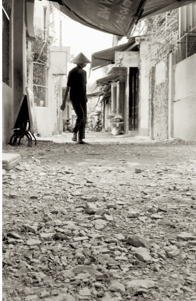
The alleyways are narrow and intimate