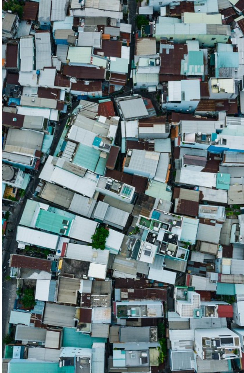
Network of hẻm