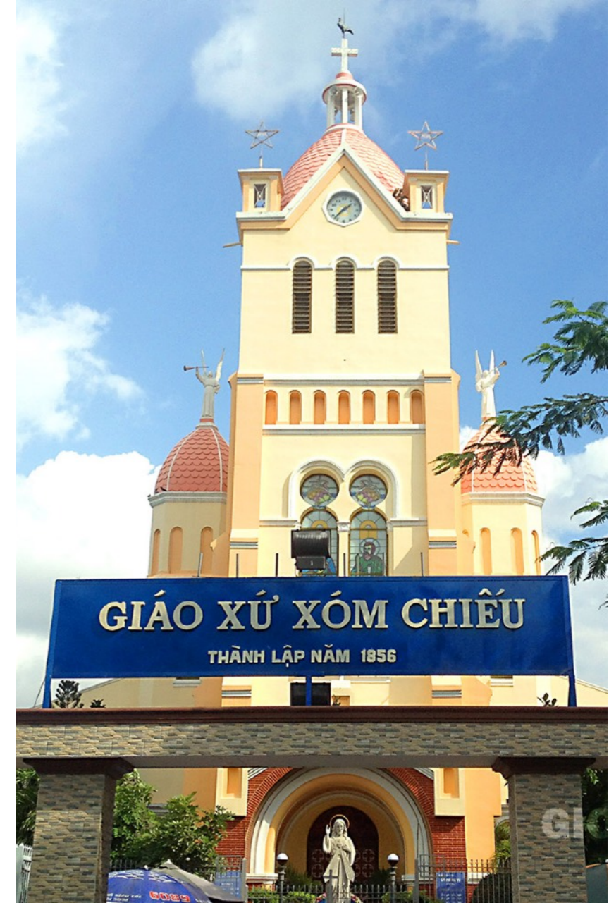
Xóm Chiếu Cathedral built in 1856